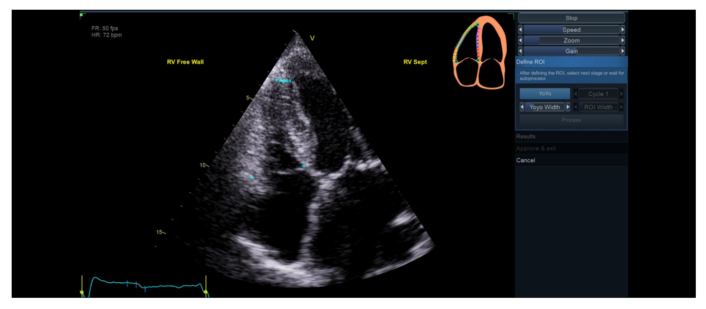
Figure 1 The AFI RV Define ROI stage.

Select an RV-focused apical view from the clipboard. Select AFI RV from the Measurement and Analysis package. Define the ROI by using the 3-Click method placing a point at the RV Free Wall Base, Sept Wall Base and at the Apex according to the guiding pictogram in